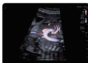
ADF Aortic Arch