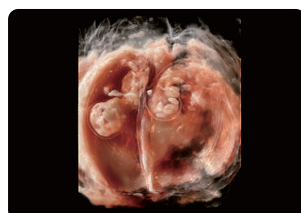
Shadow Glass Twin