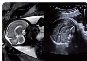
Smart Fusion Fetal Brain