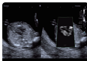
SMI Fetal Heart 1st Trimester

Toshiba Medical invites you to attend our educational sessions offered during the ISUOG World Congress in Rome, Italy. We will be hosting a Satellite Symposium on Tuesday and scientific sessions in our Hospitality Suite, throughout the day from Sunday till Wednesday, introducing the latest advances in Ultrasound imaging for Obstetrics and Gynecology.