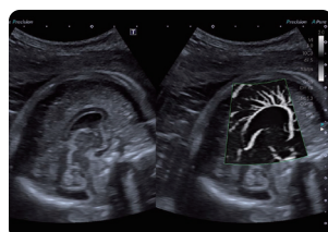
SMI Fetal Brain 2nd Trimester