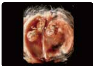
Shadow Glass Twin