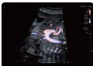
ADF Aortic Arch