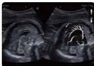
SMI Fetal Brain 2nd Trimester