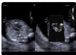
SMI Fetal Heart 1st Trimester

Toshiba Medical invites you to attend our educational sessions offered during the ISUOG World Congress in Rome, Italy. We will be hosting a Satellite Symposium on Tuesday and scientific sessions in our Hospitality Suite, throughout the day from Sunday till Wednesday, introducing the latest advances in Ultrasound imaging for Obstetrics and Gynecology.