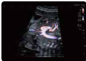
ADF Aortic Arch