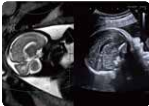
Smart Fusion Fetal Brain