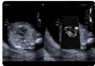
SMI Fetal Heart 1st Trimester

Toshiba Medical invites you to attend our educational sessions offered during the ISUOG World Congress in Rome, Italy. We will be hosting a Satellite Symposium on Tuesday and scientific sessions in our Hospitality Suite, throughout the day from Sunday till Wednesday, introducing the latest advances in Ultrasound imaging for Obstetrics and Gynecology.