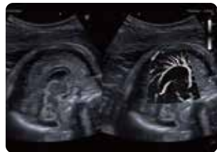
SMI Fetal Brain 2nd Trimester